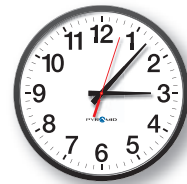
Face Type A