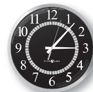
Face Type I