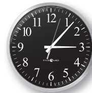
Face Type H