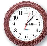
Face Type L