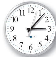
Face Type D