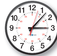
Face Type B