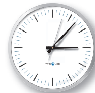
Face Type G