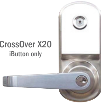
CrossOver X20 iButton only